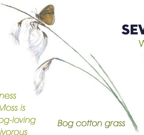
Bog cotton grass

The wetland wilderness of Commonhead Moss is home to special bog-loving plants like the carnivorous sundew and fluffy bog cotton grass.